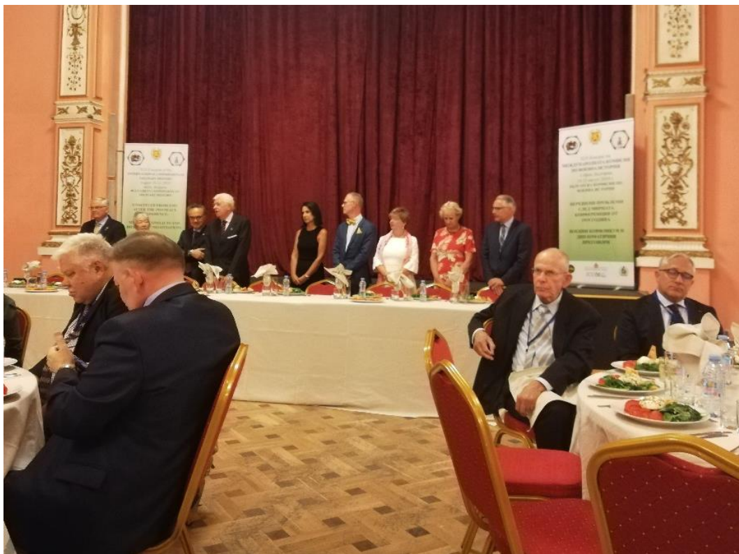
The final official dinner