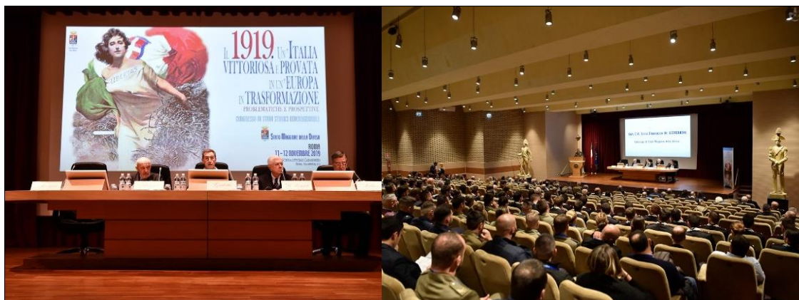
Views of the conference in Rome

As every year, the Defence Staff Historical Office/Italian Commission of Military History has organized an international conference, which took place in Rome on 11th and 12th November 2019. The conference was sponsored by two important Italian universities (the Università Cattolica del Sacro Cuore of Milano and “La Sapienza” Università di Roma) and had the ICMH patronage. This year’s conference was a complement to five-years series on the First World War initiated in 2014 and focused on the year 1919, having as General Theme: 1919. A victorious and fatigued Italy in a Europe in transformation. More than 30 scholars from three countries examined various aspects of the year characterized by the Paris peace conference: the demobilization, the territorial issues, the confrontation between the “old”, better to say traditional, diplomacy the military fronts, the political and diplomatic strategies, and propaganda. Acta will be published in Spring 2020.