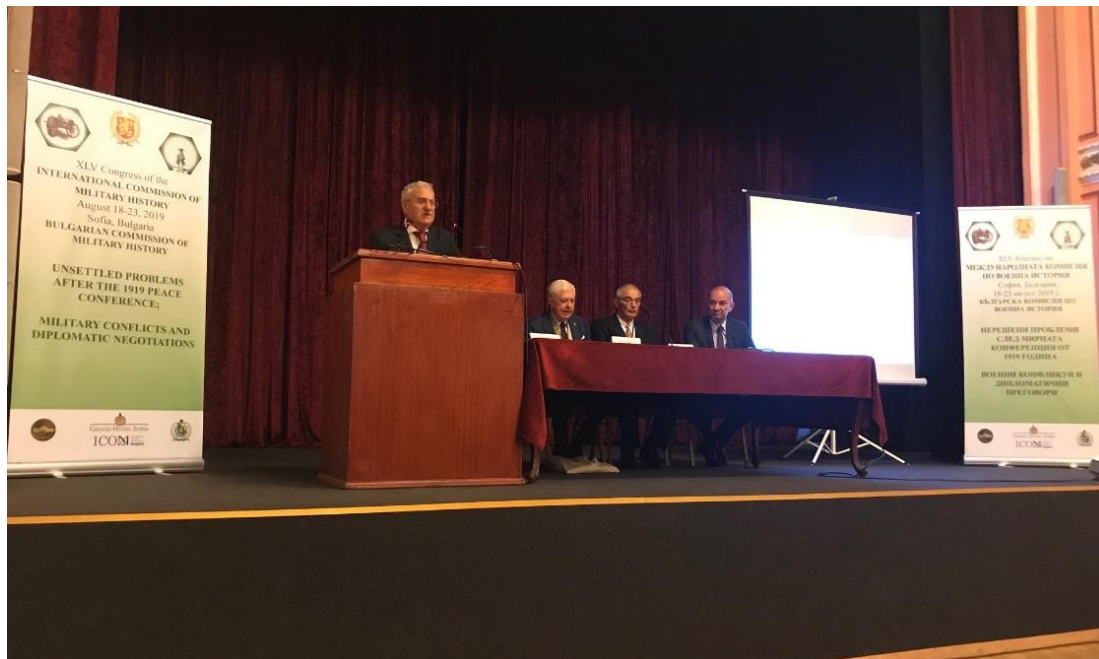
The inaugural session